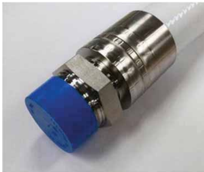
Figure 2 - Megafang Crimp Collar