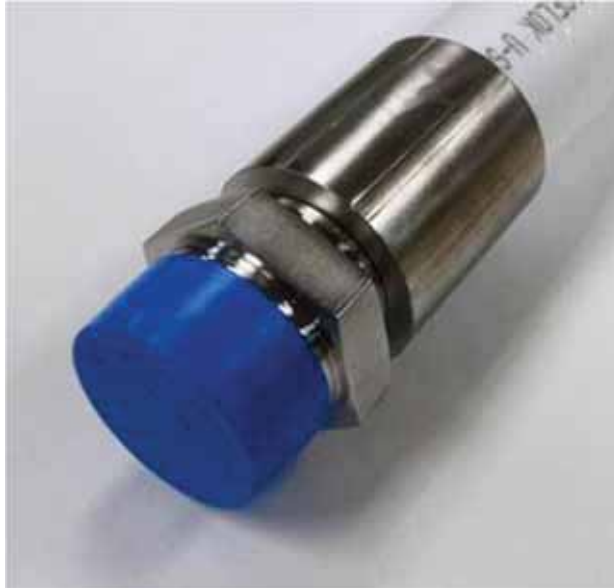
Figure 1 - Standard Crimp Collar

All end connection inserts are crimped onto the hose using crimp collars. The U-Series hose crimp collars have two designs: the standard crimp collar available in 1/2", 3/4" and 1" sizes, and an upgraded design named "Megafang" which has shown more robust performance (1/2", 3/4" and 1" sizes noted in Table 2 to be widely available in 2021). Assemblies for both crimp collar designs noted above follow the same method of assembly and materials of construction. See photos below for visual differences between standard crimp collars and Megafang crimp collars.